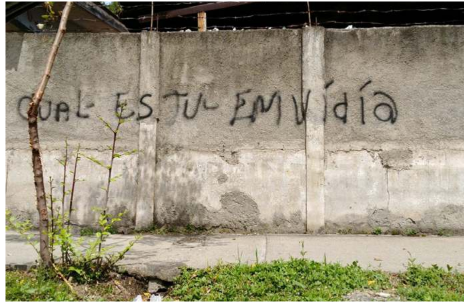
Photos submitted by Premise Contributors documenting graffiti, one proxy measure of gang influence measured in the project.