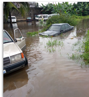
Ogba-Egbema, Rivers State (5.553790, 6.585510 / 5.323360, 6.652480)