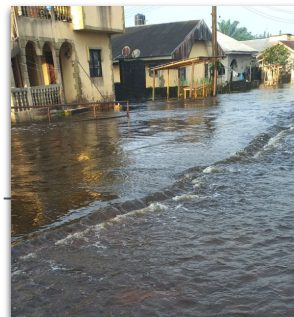
Isoko South, Delta State (5.452100, 6.213970)