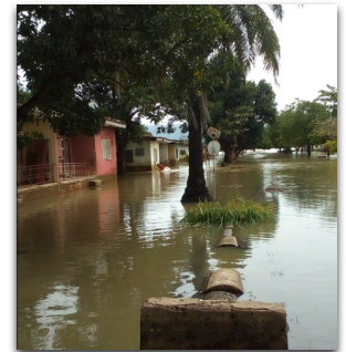
Ajaokuta, Kwara State (7.838930, 6.747980)