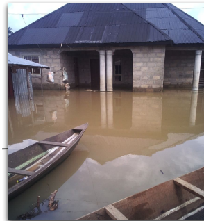
Lokoja, Kwara State (7.838930, 6.747980)