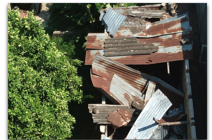
Marracuene, Maputo (-25.74313, 32.63076)

In what way(s) have you been affected by Cyclone Freddy? [Select all that apply]