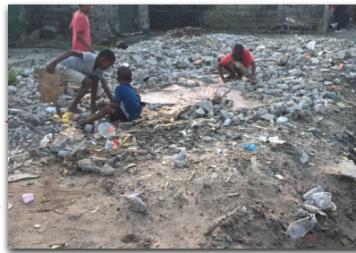
Dondo, Sofala (-19.83231, 34.85481)