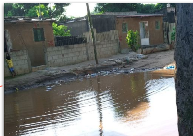
Maputo, Maputo City (-25.96008, 32.56115)